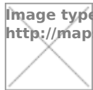
Image type unknown http://maps.google.com/maps/api/staticmap?center=39.01034,-74.79273&zoom=17&markers=39.01034,-74.79273&size=500x500